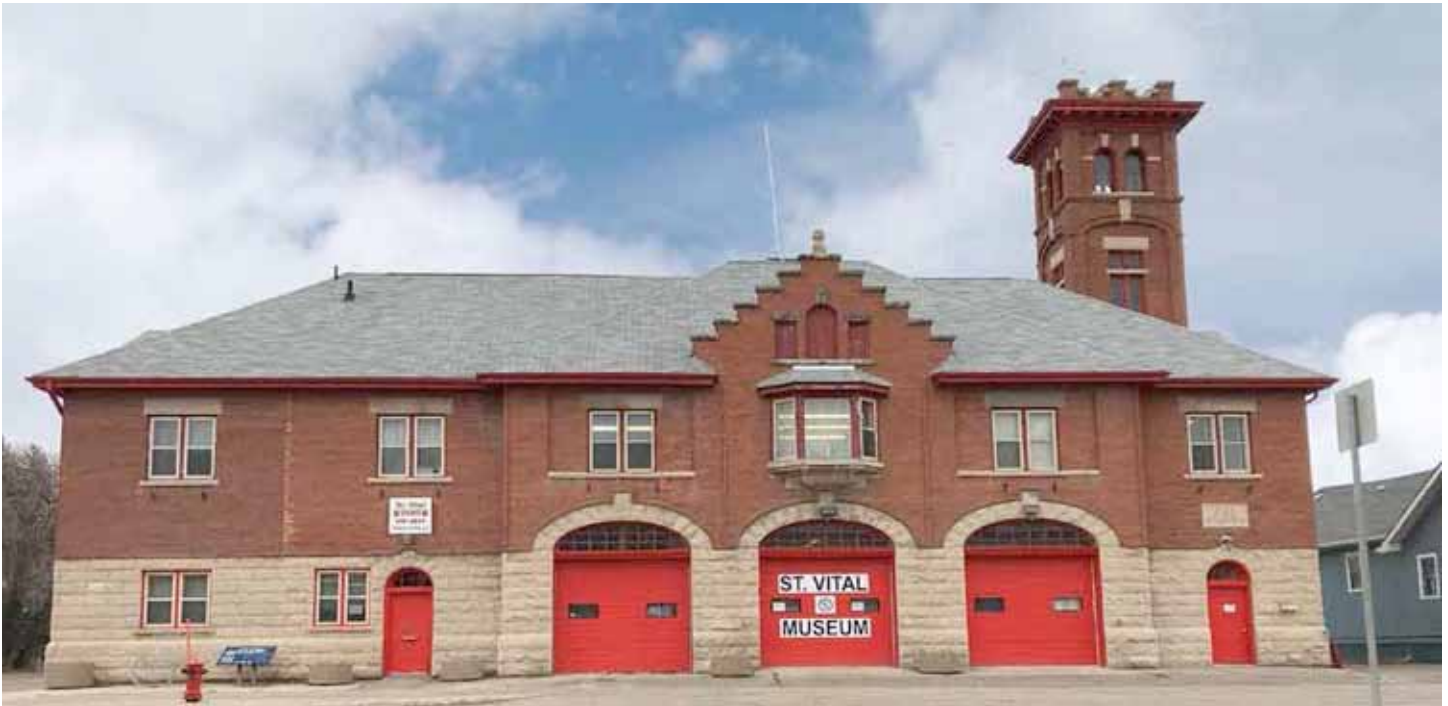
The 114-year old fire hall is the cover of the 2019 calendar.