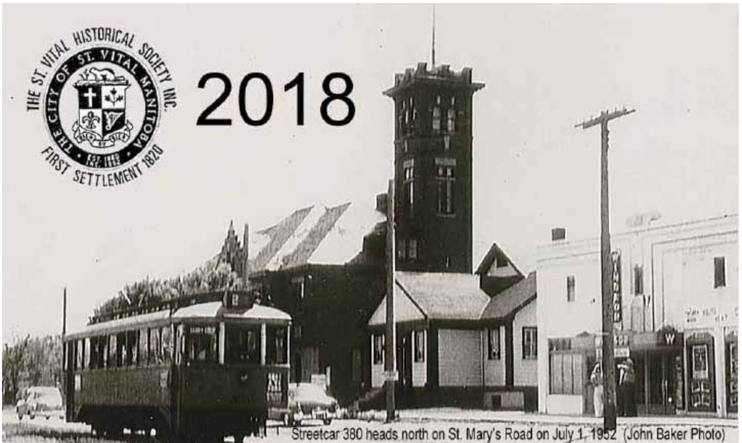
Streetcar 380 heads north on St. Mary's Road on July 1, 1952