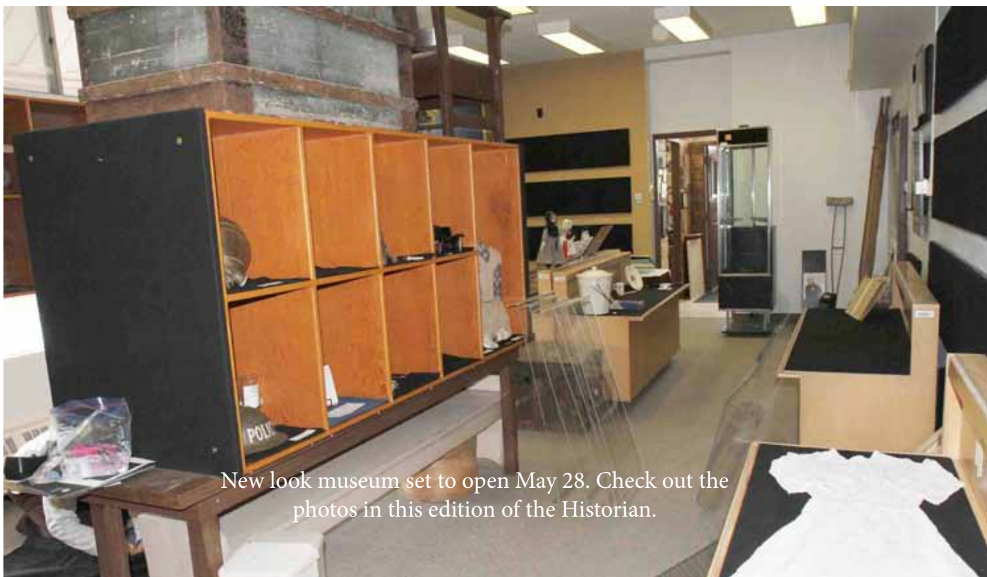
New look museum set to open May 28. Check out the photos in this edition of the Historian.