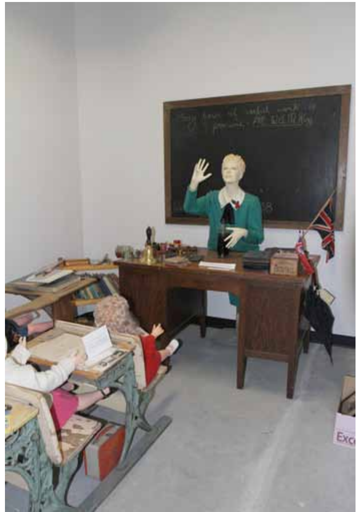
The school room has been moved into a room located in the new area of the Museum. Work is continuing on the main display area. Bob Holliday photos