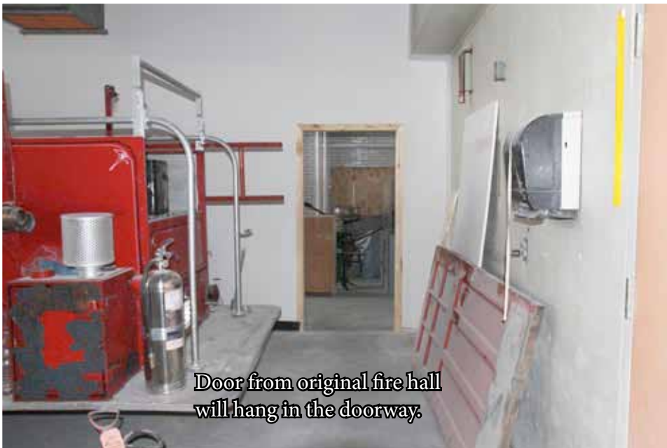
Door from original fire hall will hang in the doorway.