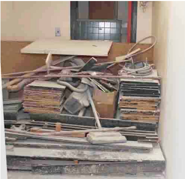
Clutter in the basement hallway has to be cleaned. Some of the clutter is storage shelves which will be rebuilt..