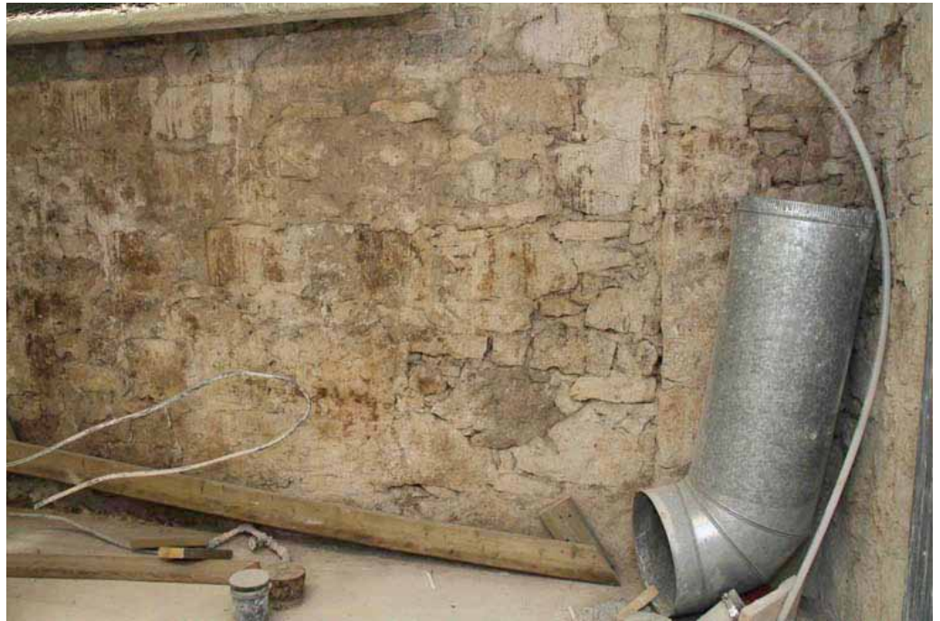
The original wall will be left bare in some areas of the basement.