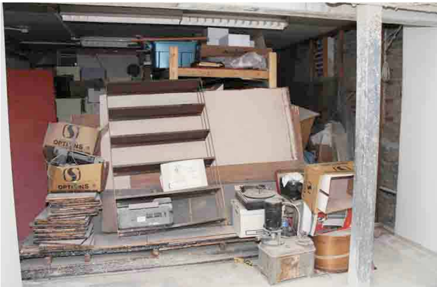
This is what awaits staff and volunteers in the main basement storage area.